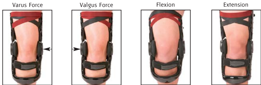
These photos demonstrate the action of the ATC system under various conditions (the active straps are in red)

The patented ATC system dynamically tensions the brace during flexion, extension, internal rotation and external rotation, and allows the brace to respond to varus or valgus forces.